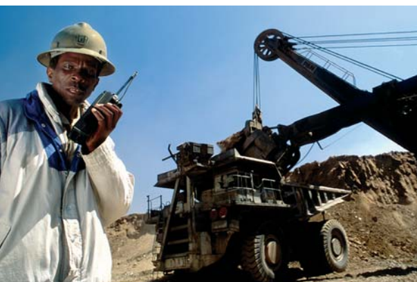
Copper mining in Zambia. Research suggests that states with abundant natural resources have less incentive to rely on taxation of citizens for revenue, and that this can result in poor governance.

Research suggests that a lack of bargaining with citizens over tax can lead to governance problems. States with abundant natural resources for export have limited incentives to create institutions to collect or administer tax, or to provide vital services in poorer, more remote areas. While some countries, such as Botswana, have successfully managed their natural resource wealth, there is widespread evidence of bad governance associated with limited state reliance on taxation.