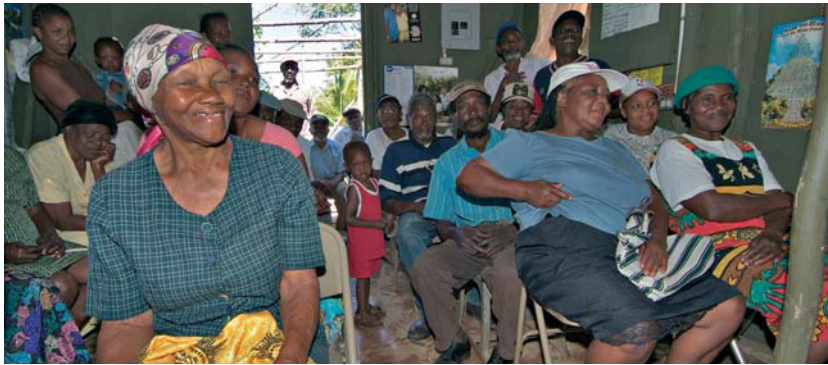
A community meeting in Jamaica. Research shows taxation can lead citizens to come together to demand accountability from local and state officials.

Tax reform is a complex process, with equity implications and conflicting objectives. Indeed, reducing trade taxes too rapidly can impact on other sectors, while seeking to maximise revenue could increase coercion or encourage revenue authorities to focus on a small group of large taxpayers rather than broadening the tax base.