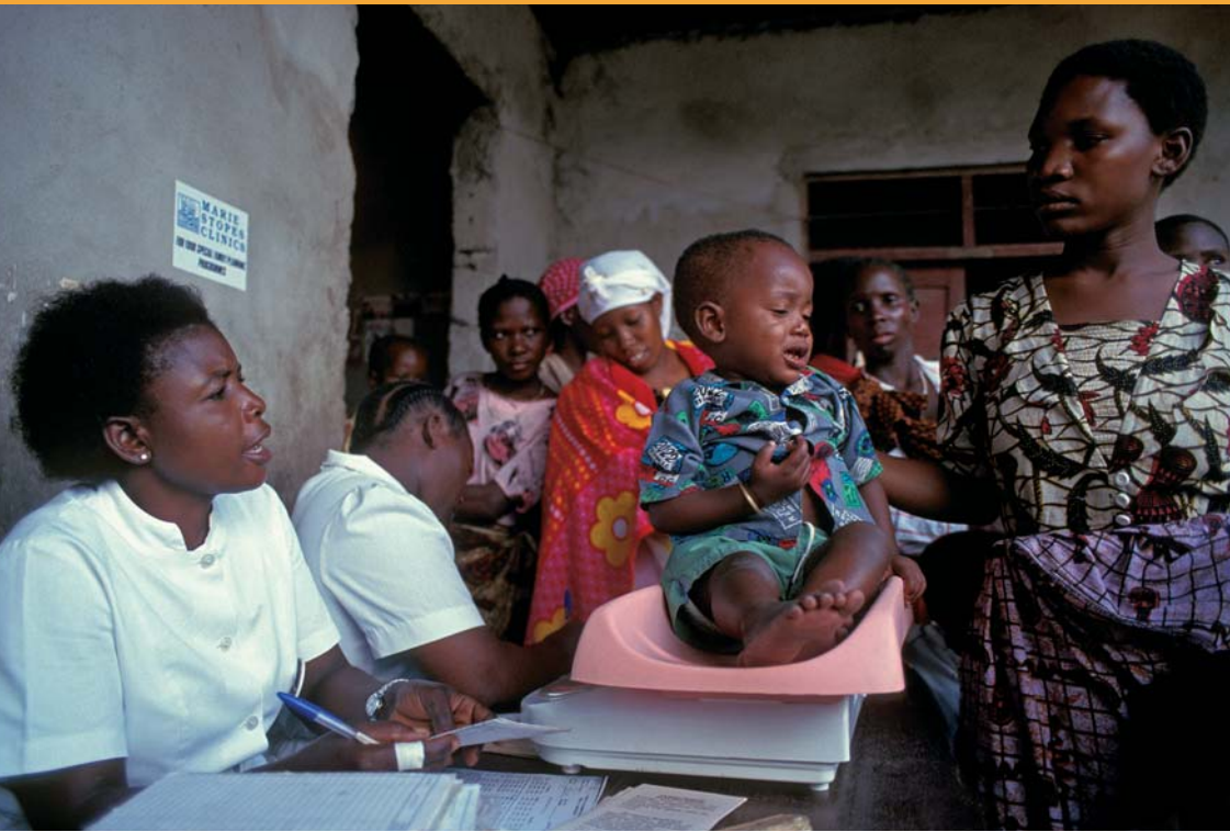
Family planning clinic, Tanzania. People's attitude toward taxation in Tanzania became more positive when they saw improvements in education and healthcare.