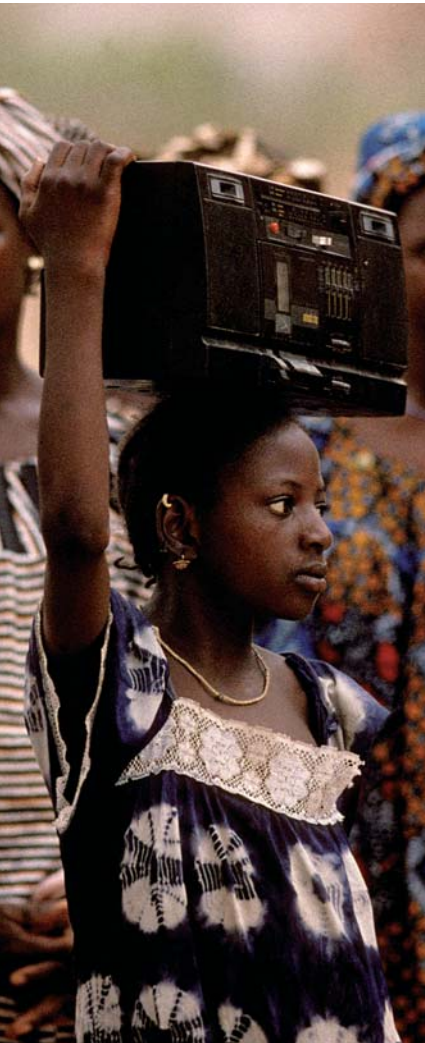
Listening to the radio in Mali. The media can make links between the interests of taxpayers and public spending.

There are no automatic links between taxation and better governance. Much depends on the behaviour of revenue authorities and on public attitudes to taxation. Public information or debate about sources of government revenue – including tax – can be rare in developing countries. While the media regularly discuss wasteful or inadequate public spending and systemic corruption, they seldom explore the links between this and taxpayers' interest in seeing their money well spent. There is, therefore, an opportunity to increase awareness and discussion of these issues.