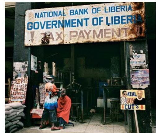
A hairdresser cuts a customer's hair in a makeshift barber shop that he has set up in the abandoned tax department of the derelict National Bank of Liberia.

There are many reasons why low-income countries struggle to increase their tax take. Collection costs in poor, agrarian economies are high and farmers' incomes are seasonal and unstable. It is also notoriously difficult to tax the informal sector. Efforts to collect tax therefore tend to focus on a smaller number of people and firms, but these can often avoid taxes because of their power and influence.